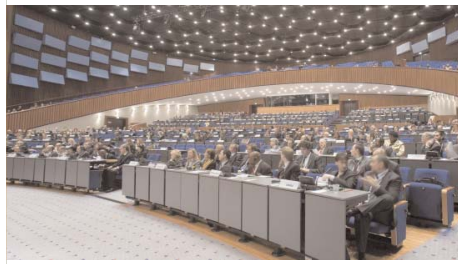
ASP delegates attending the fifth session / ICC-ASP

The International Criminal Court's proposed budget for 2007 was discussed during the fifth session of the Assembly of State Parties (ASP). In order to facilitate and structure the discussions around the Court's 2007 budgetary submission, the Working Group on the Programme Budget was established. The Working Group held seven meetings from 24 to 29 November in preparation for the Assembly's fifth session. They produced a report assessing inter alia the proposed budget programme and the reports of the Committee on Budget Finance that was later endorsed by the Assembly.